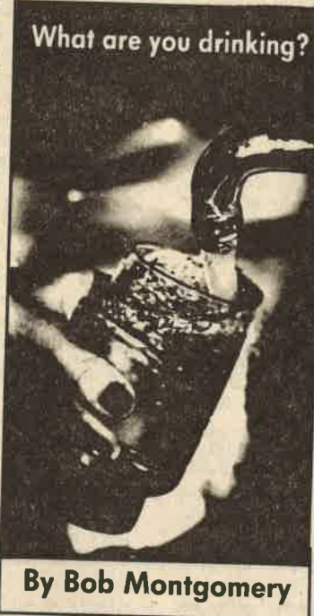
By Bob Montgomery

try, extraction and purification of penicillium and other pharmaceuticals, manufacture of artificial silk, plastics, floor polishes, and fluorocarbons. Cancer risk is 1-in-100,000 for prolonged contact with 1.9 parts per billion. Environmental Protection Agency allows in public water supplies up to 100 parts per billion of all four trihalomethanes combined — chloroform, bromoform, chlorodibromoethane and bromodichloromethane. Side effects from exposure to large amounts include digestive disturbances, dizziness, mental dullness and coma. Alcoholics are affected sooner and more severely. Points of attack are liver, kidney, heart, eyes and skin. Carcinogenic.